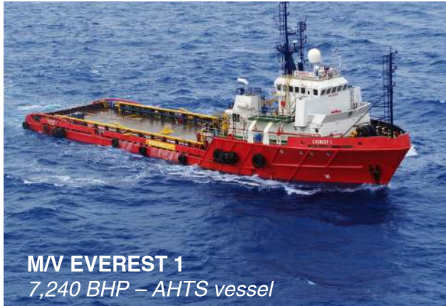
M/V EVEREST 1 7,240 BHP – AHTS vessel