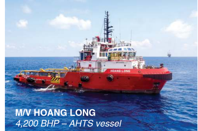
M/V HOANG LONG 4,200 BHP – AHTS vessel