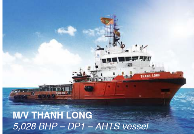
M/V THANH LONG 5,028 BHP – DP1 – AHTS vessel