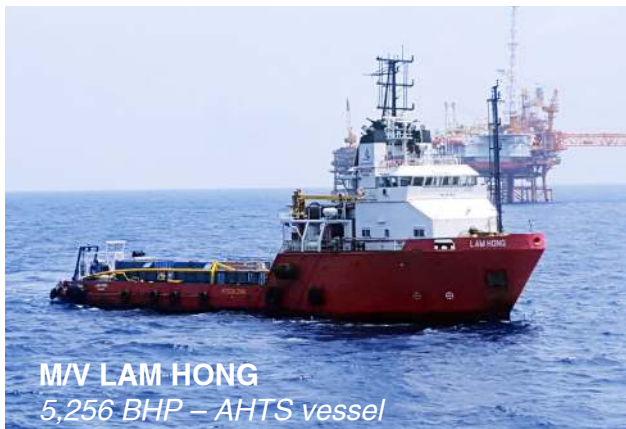
M/V LAM HONG 5,256 BHP – AHTS vessel