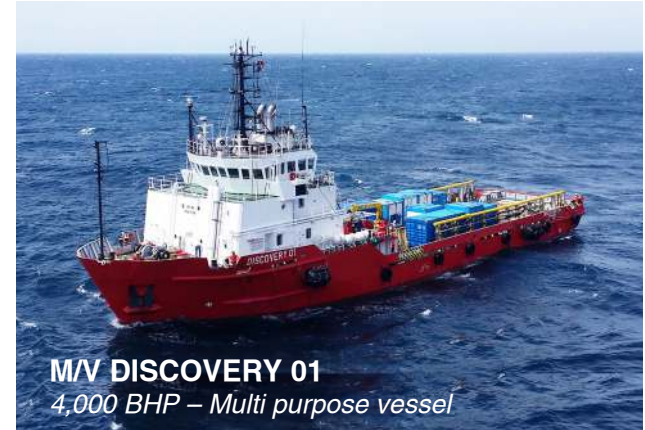
M/V DISCOVERY 01 4,000 BHP – Multi purpose vessel