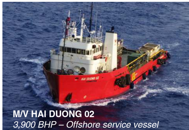
M/V HAI DUONG 02 3,900 BHP – Offshore service vessel