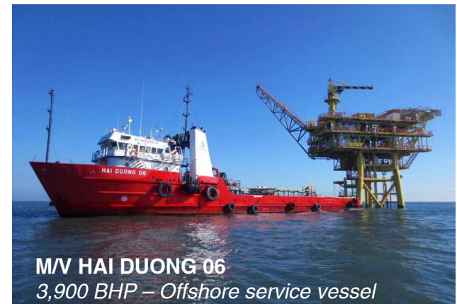
M/V HAI DUONG 06 3,900 BHP – Offshore service vessel