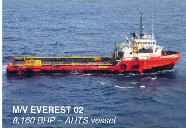
M/V EVEREST 02 8,160 BHP – AHTS vessel